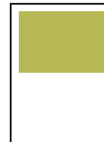
1/2 Page 4.75" x 3.75"h