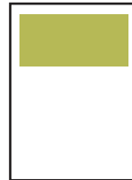
1/3 Page 4.75"w x 2.25"h